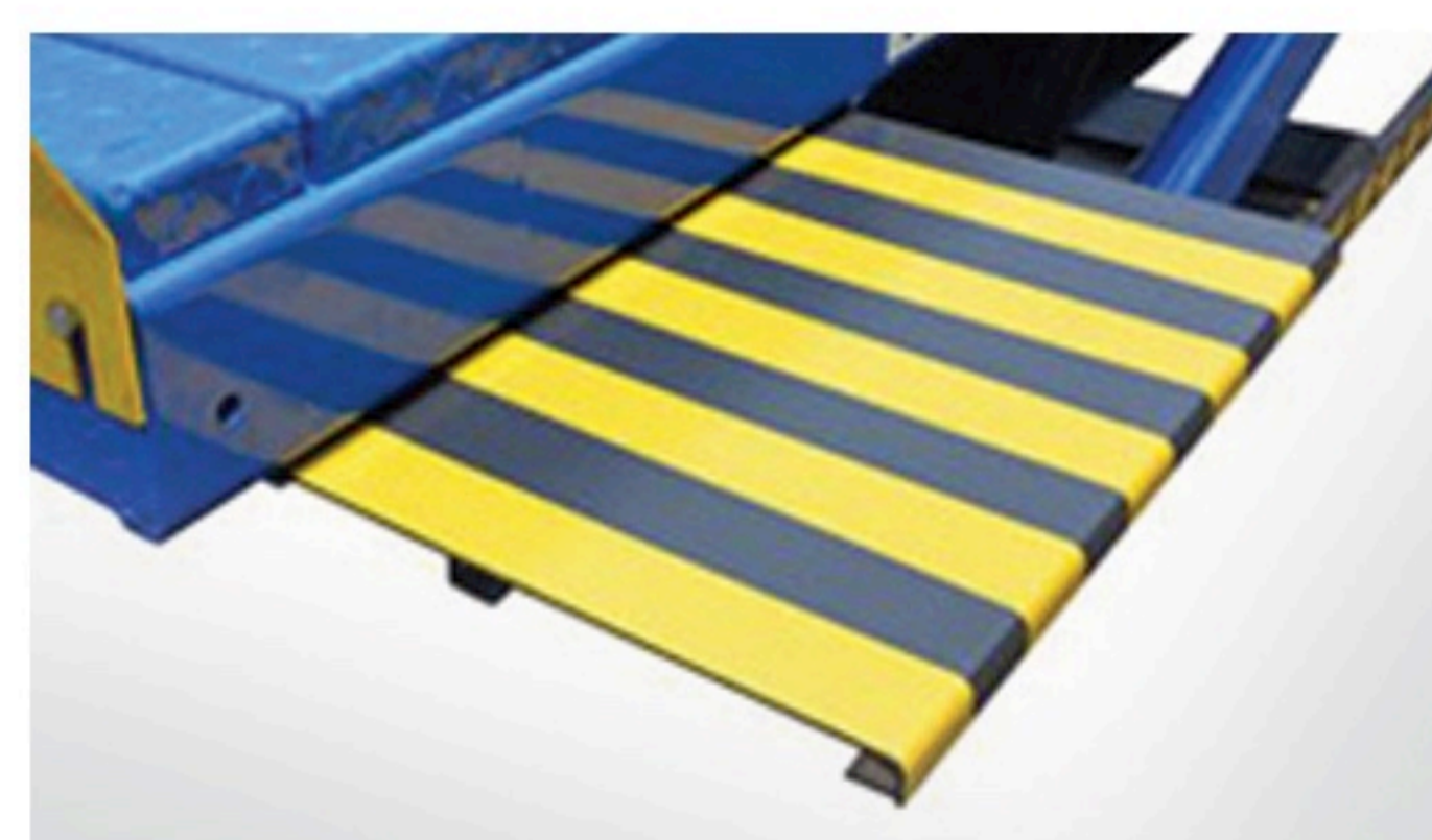
Shelf For Service