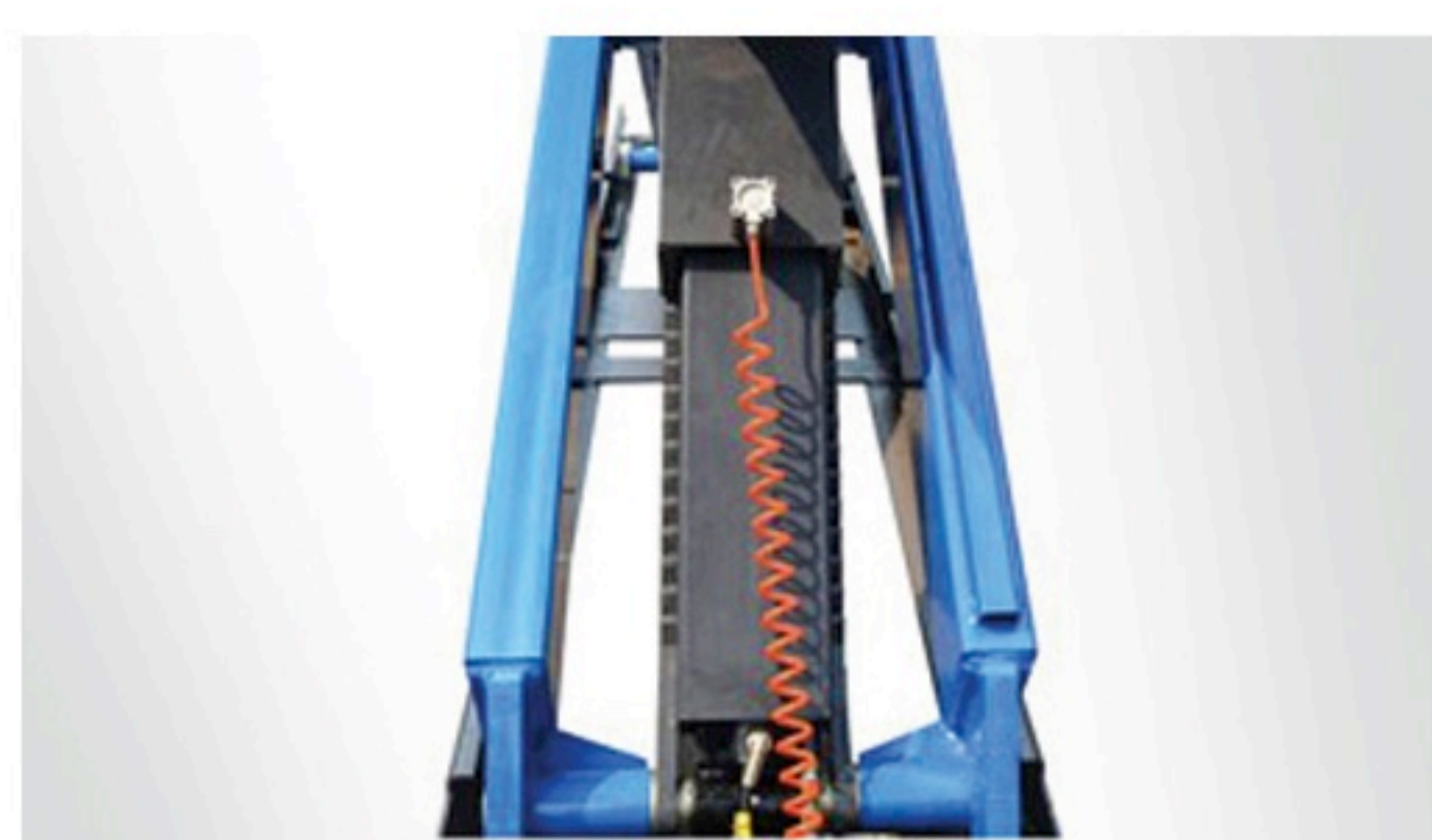
Electro-air Safety Device