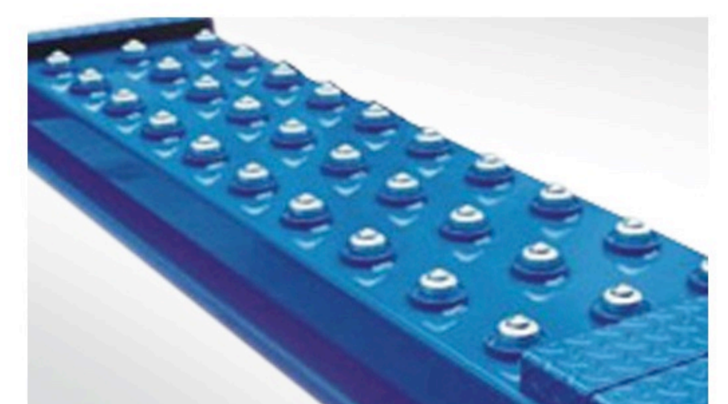
New rear-slip ball sets