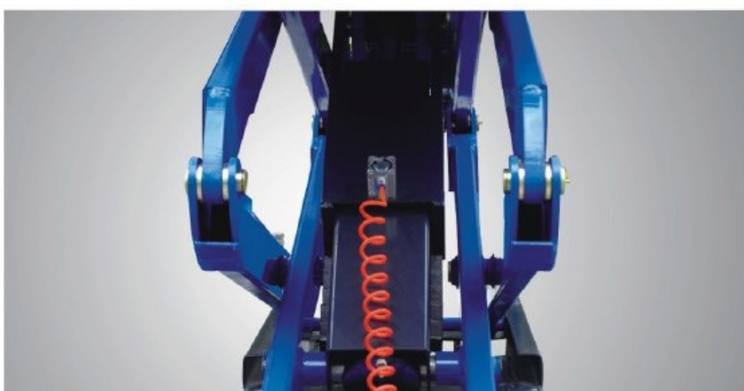
Automatic Safety Device