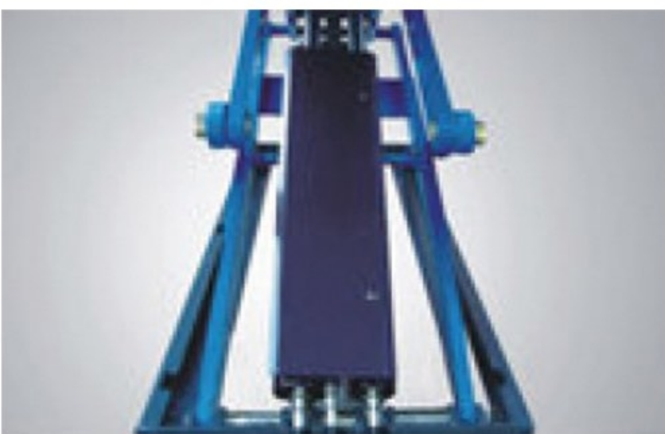
Dual synchronous cylinders